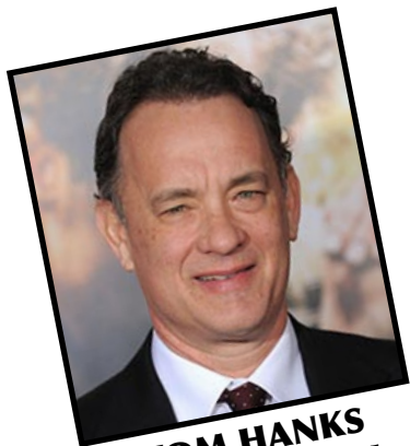
TOM HANKS Saving Mr. Banks