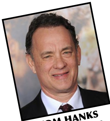
TOM HANKS Saving Mr. Banks